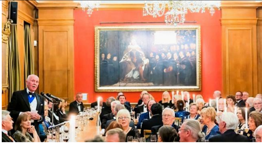
The Master speaks