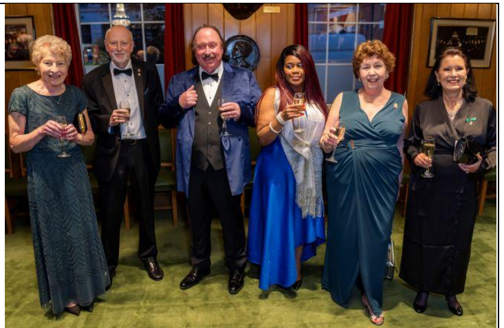
Members at the pre-dinner reception