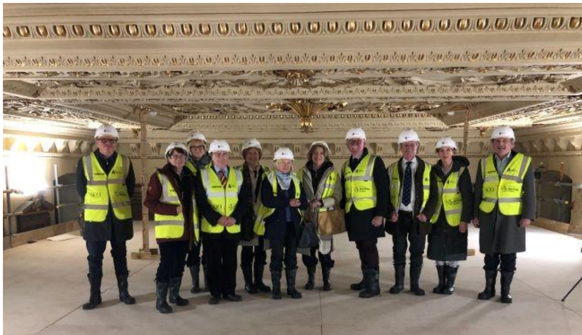
Donned in safety gear we were able to see the work on the ceiling close up

As those who were able to attend the Master's Installation know, his year got off to a good start and his events continue to be popular: We had a fascinating tour of the restoration work taking place at St Bartholomew's Great Hall, which will reopen to the public this autumn returned to its full splendour, the visit evening concluded with a surprisingly good pub supper.