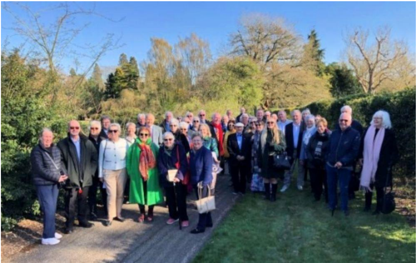
The Group in Sandringham Gardens