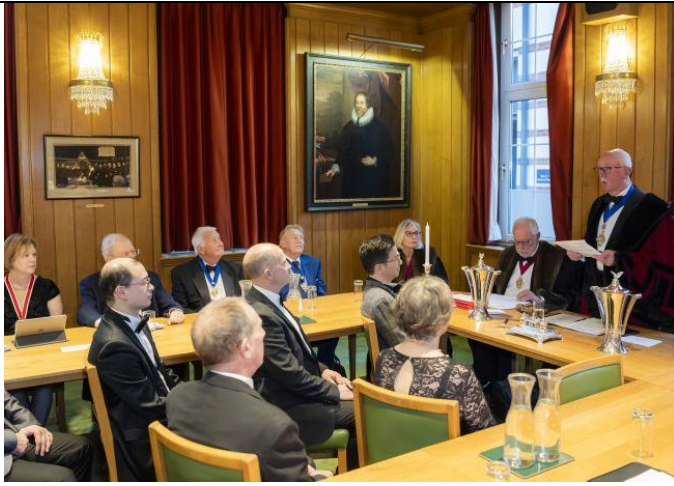
The Master welcomes new members