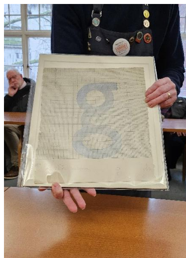
An early example of Newspaper printing; the formation of Gill Sans font