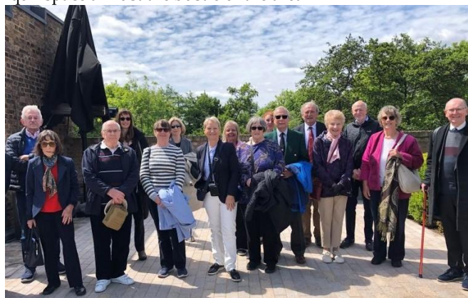
Those who elected to take the long walk