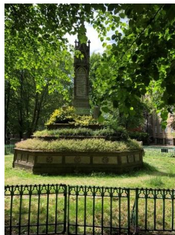
St Pancras Church and graveyard – a tranquil space amidst the bustle of the area