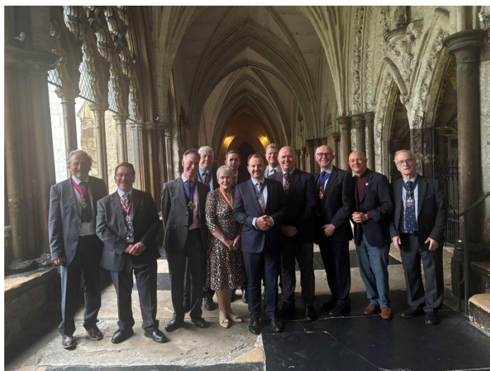
The Master and Renter Warden with fellow Masters and Wardens enjoy a private tour of Westminster Abbey

It has been a busy couple of months and the Master has been particularly busy representing the Guild at special events such as the Speech Day at Christ's Hospital, one of the Guild Charity's affiliated schools, as well as enjoying some more of his events with those members who have attended.