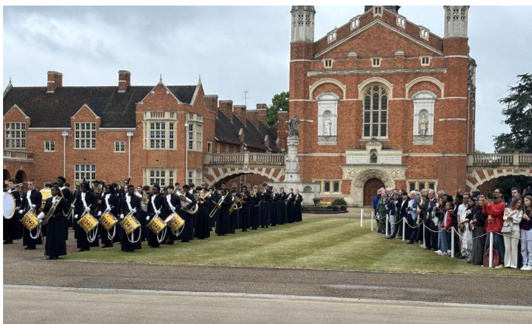
Christ's Hospital School Speech Day