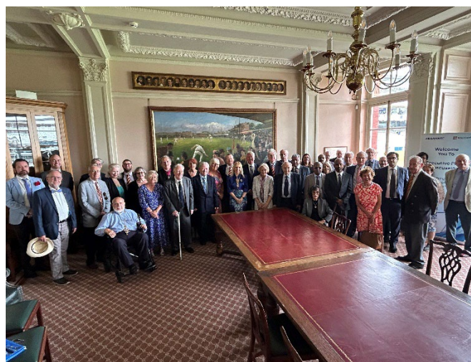
In the writing room