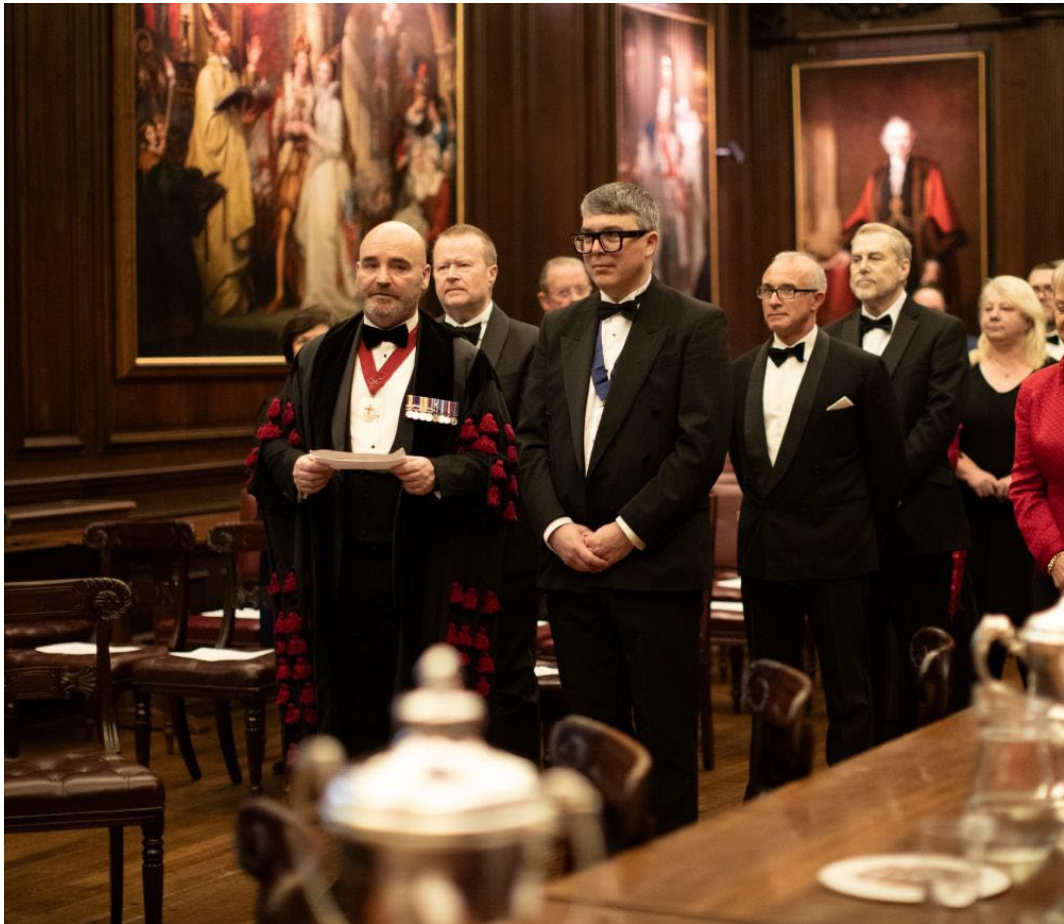
Joining members processing in to Court for their admission ceremony.