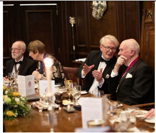
Murray and the Master deep in conversation