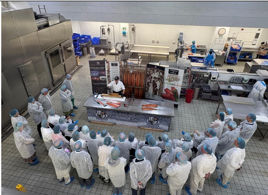
How to carve a smoked salmon demonstration