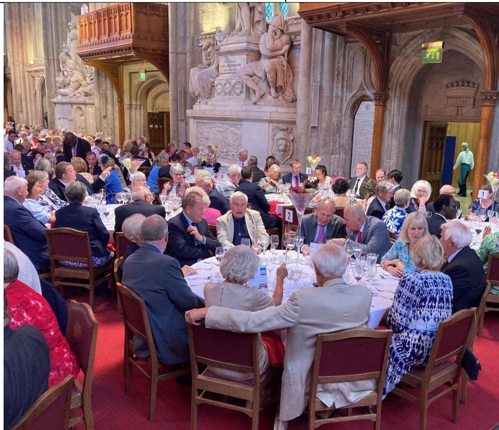
Members enjoying lunch at Guildhall following the Cart Marking